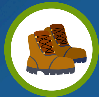
Trekking Shoes ₹ 500