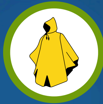
Ponchu ₹ 200