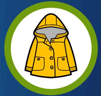
Jacket ₹ 500