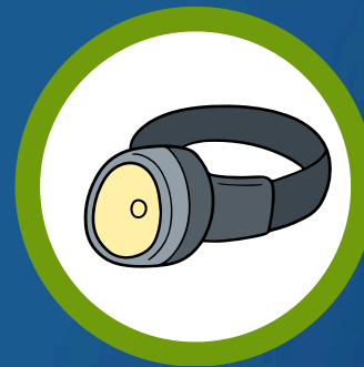
Head Torch ₹ 200