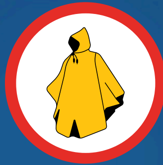
Ponchu ₹ 200