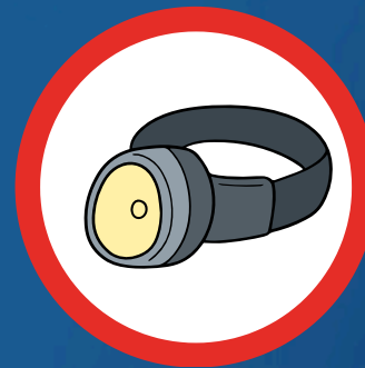
Head Torch ₹ 200