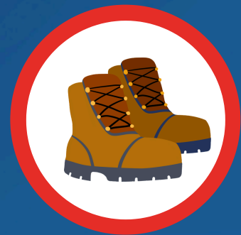
Trekking Shoes ₹ 500