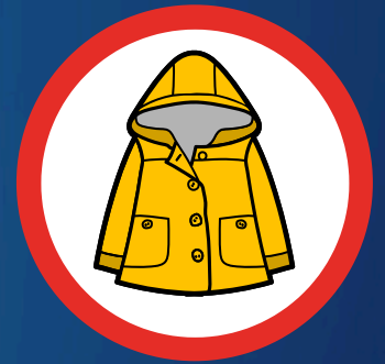
Jacket ₹ 500