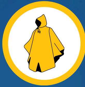
Ponchu ₹ 200