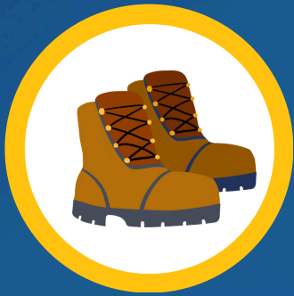
Trekking Shoes ₹ 500