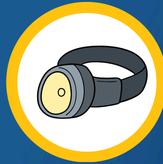
Head Torch ₹ 200