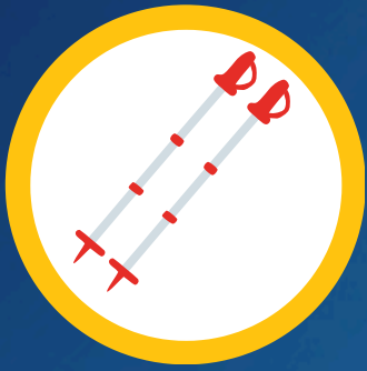
Trekking Stick ₹ 250