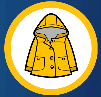
Jacket ₹ 500